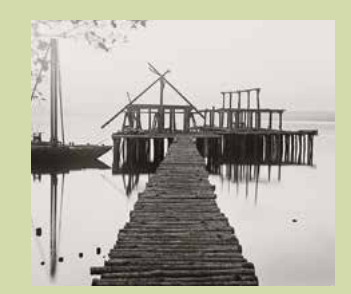
Special exhibition 100 Years Lake Dwellings of Unteruhldingen