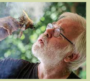
Programmes for groups and school classes. Information at: www.pfahlbauten.de