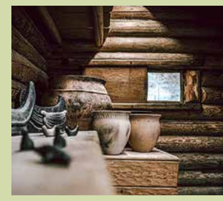
Insights into the houses of the open-air site