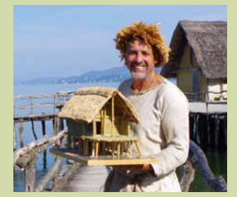
Stone Age Trail: HOUSE ON THE LAKE -How Lake Dwellers build Dates: www.pfahlbauten.de