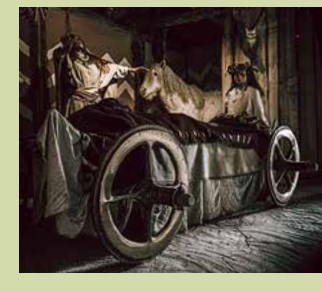
Real-life scenes, figurines, animals, models