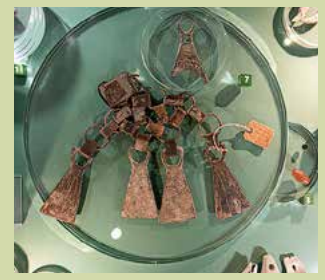
Special exhibition: "The Heritage of the Lake Dwellers - Fascination of World Cultural Heritage"